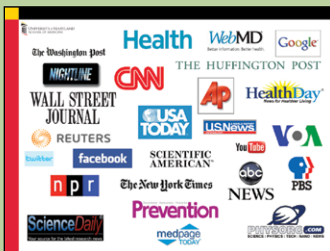
RCN representatives work with Public Affairs to get attention for your research from a variety of media outlets.