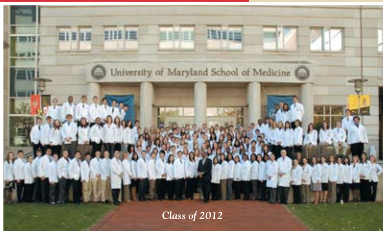
Class of 2012