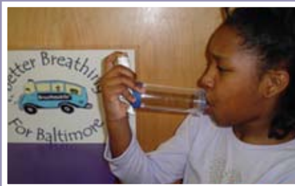
An asthma patient demonstrates how to properly use an inhaler and spacer as she was taught on the Department of Pediatrics’ Breathmobile.

Correction: SOMnews regrets the usage of the asthma inhaler graphic that accompanied the Keeping Asthma at Bay—Pediatric Asthma Collaborators Work with Their Young Patients article that ran in the February 2009 issue. A correct depiction of how a pediatric asthma patient should use an inhaler—with the spacer piece—is pictured below.