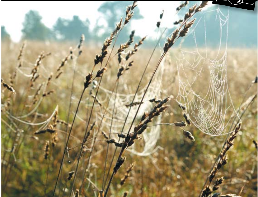
Spider Webs in the Field, Cromwell Valley Park, Baltimore County