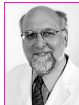
Robert Redfield, MD

The grant from the Department of Health and Human Services' Health Resources and Services Administration will enable the consortium to nearly double the delivery of anti-HIV drugs to HIV-infected persons in parts of Africa, the Caribbean and Latin America. "The consortium will expand, on a sustainable basis, the provision of durable therapy to the greatest number of needy patients," says Robert R. Redfield, Jr., MD, professor of medicine and microbiology & immunology, and director of the IHV's Clinical Care and Research Division.